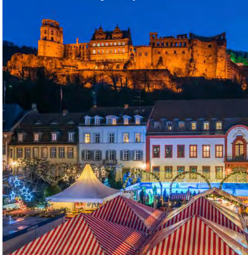
Christmas Market, Heidelberg, Germany

Savor the scents of roasted almonds as you browse among the illuminated Christmas trees at the Christmas market beneath the Dome of Lights. Enjoy expansive city views from the heights of the Burgplatz Ferris wheel. Skaters may choose to glide across the Kö ice rink.