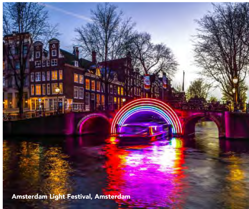
Amsterdam Light Festival, Amsterdam

This morning, relax on board or join your guide for a comprehensive scenic walking tour of central Amsterdam. Along elm-shaded canals, walk the maze of 17th-century stone streets in the Jordaan quarter. At Galerie Ron Mandos , explore rotating shows by leading Dutch artists and global creators.