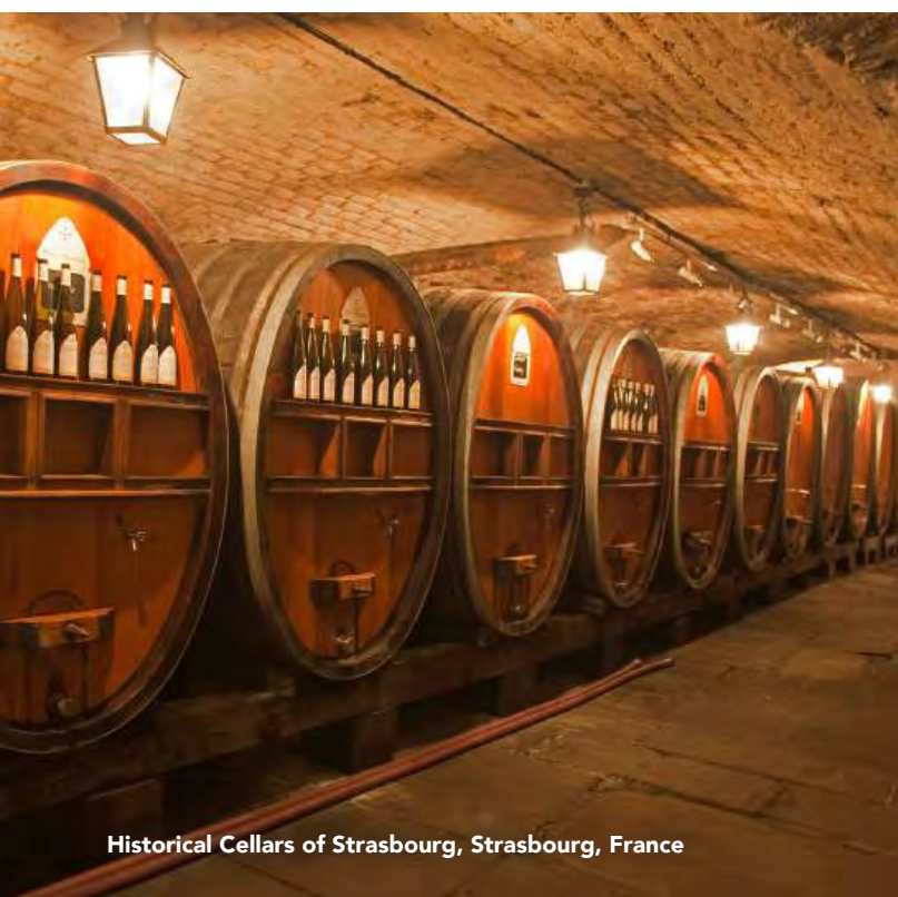
Historical Cellars of Strasbourg, Strasbourg, France

Disembark the ship in Basel and transfer to the airport for your flights home. B