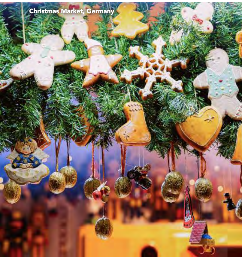
Christmas Market, Germany

Option 2: Bike along the Neckar River to the medieval town of Ladenburg and visit its Marktplatz , or explore the Christmas market in one of Germany's oldest cities, Speyer , home to Europe's largest Romanesque cathedral—a UNESCO World Heritage Site. B,L,D