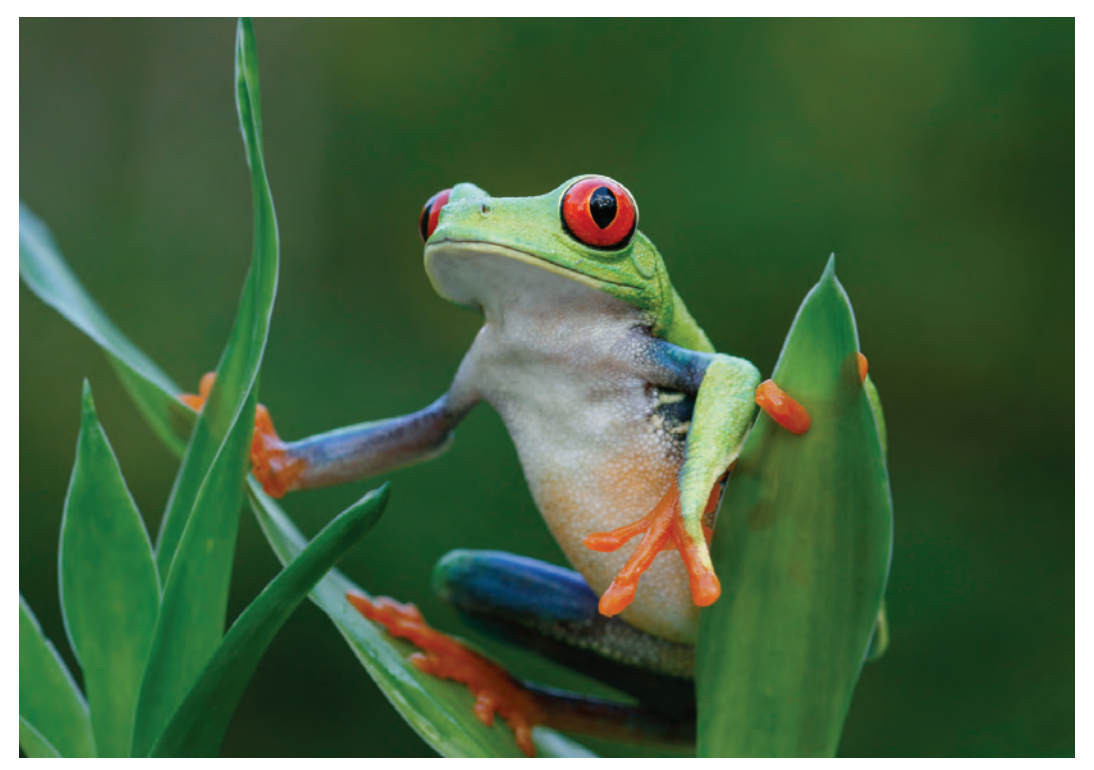
We see many colorful tree frogs in Costa Rica's rainforests.

Day 5: Arenal Region On this morning's visit to Arenal's Mistico Park hanging bridges, we have the special opportunity to experience the rainforest from the canopy level as we traverse a series of five suspension bridges high above the forest floor. While we observe the rainforest from a unique perspective, our naturalist guide will point out some of the flora and fauna that thrive here. Then we return to our hotel, where the remainder of the day is at leisure to relax amidst the beautiful grounds. Lunch and dinner today are on our own. B