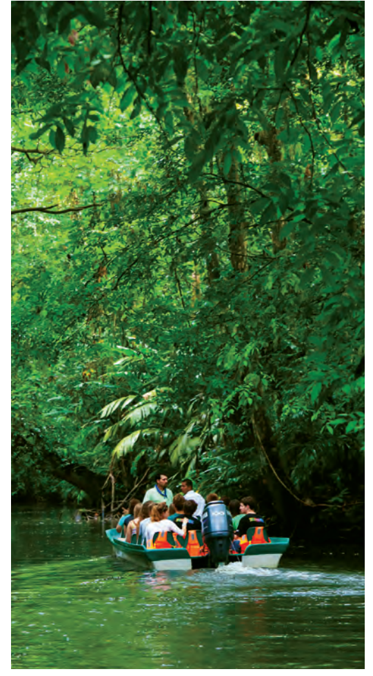
Tortuguero canals (pre-tour option)