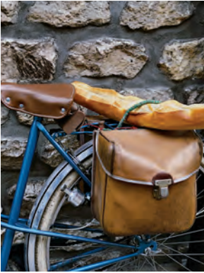
Typical French scene

Day 13: Crépon/Giverny/Paris This morning we visit the village of Giverny and the home and gardens of Impressionist artist Claude Monet. Here we see the familiar lily pond and wisteria-covered Japanese footbridge of Monet's paintings, as well as his home, now restored to its original design. Then we travel to Paris, reaching our hotel late afternoon. We are free for dinner on our own in this culinary capital. B