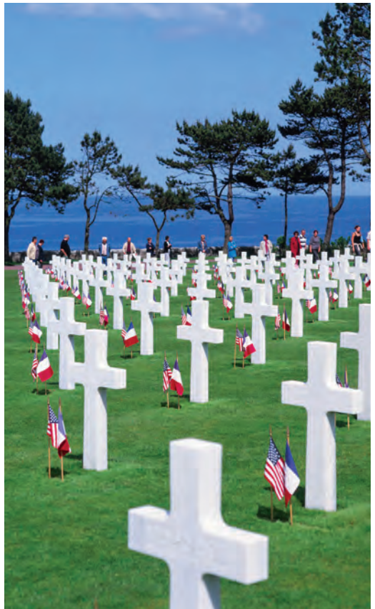
We visit the American Cemetery at Omaha Beach.