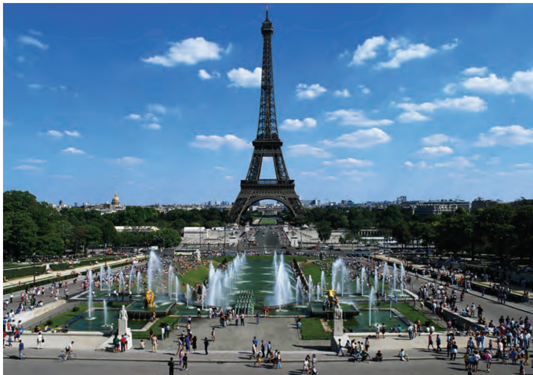
Discover Paris with its iconic Eiffel Tower.

some of Sarlat's museums or art galleries – or simply to wander the atmospheric cobblestone streets. After lunch on our own we visit nearby Rocamadour, a revered pilgrimage site and medieval village whose three tiers cling almost impossibly to a sheer limestone cliff. We take a guided walking tour then enjoy some free time before we return to Sarlat mid-afternoon. Dinner tonight is on our own. B