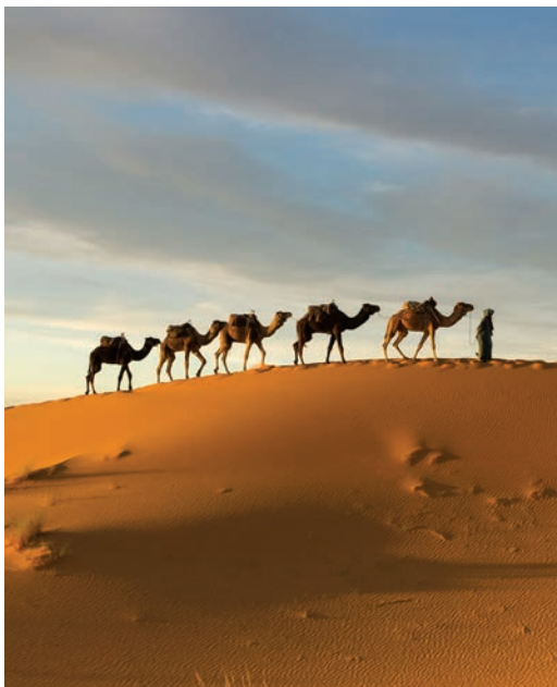
We ride camels in the Sahara on Day 8.

largest and most cosmopolitan city. After a brief orientation tour of the city, we visit the magnificent Hassan II Mosque, Morocco’s only functioning mosque open to non-Muslims. Tonight we celebrate our Moroccan adventure at a farewell dinner at a local restaurant. B,D