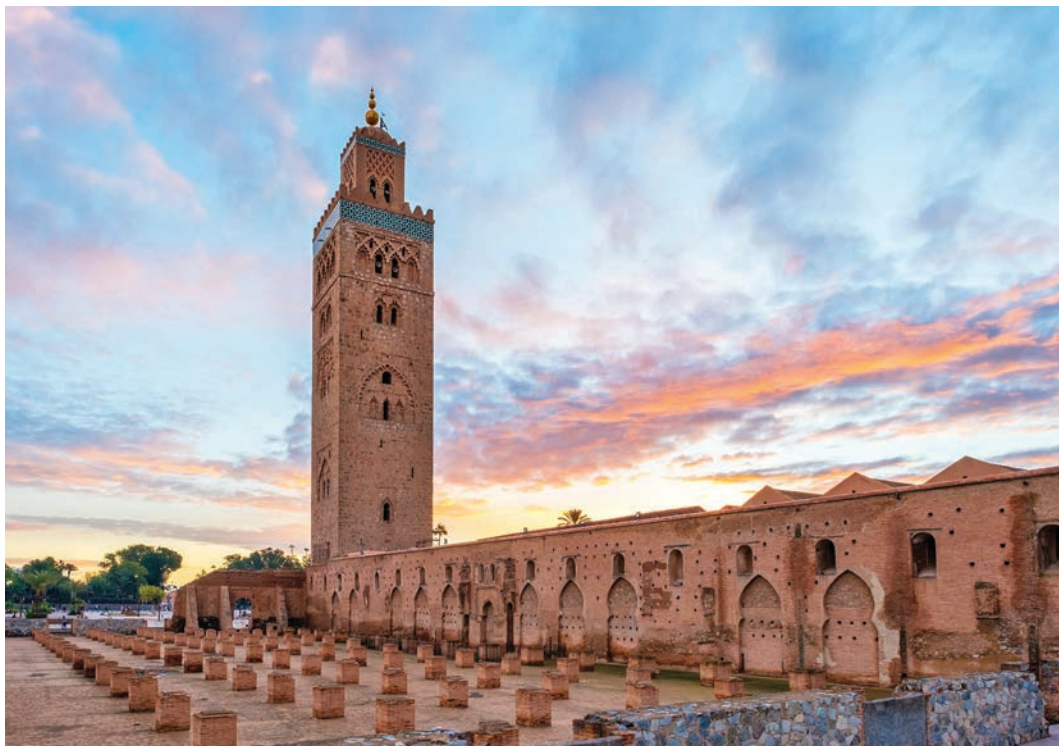
We see the distinctive Koutoubia Mosque – Marrakech’s largest – on Day 12.

Day 6: Fez We begin today with a visit to the Al-Attarine Madrasa, whose highlight is a small courtyard showcasing intricately detailed tilework and carving decorations dating to the early 1300s. We then continue our discovery on a walking tour of the medina , focusing on the artisans’ quarters, the 14 th -century Koranic schools, and Al Karaouine, the medieval theological university. The remainder of the afternoon is free for independent exploration and lunch on our own. Tonight, we enjoy a private dinner at an intimate family-run riad in Fez. B,L,D