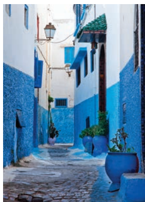
Rabat’s Kasbah des Oudaias

Day 11: Marrakech Once the capital of southern Morocco, the imperial city of Marrakech is an alluring oasis with a temperate climate, distinct charm, and fascinating sights. This morning we travel by horse-drawn carriage from Menara Park to Majorelle Gardens, a private botanical garden with some 15 species of birds native to North Africa and known for its cobalt blue accents. Following a tour of the gardens we visit the nearby Yves St. Laurent Museum, housing a vast collection of the designer’s haute couture and design works. After lunch at our hotel, mid-afternoon we embark on a walking tour of the medina , ending at Djemaa el Fna Square, a UNESCO World Heritage Site and the heart of Marrakech, crowded with snake charmers, entertainers, storytellers, musicians, barbers, and sellers of fruit, water, and spices. Dinner tonight is on our own in this exotic city. B,L