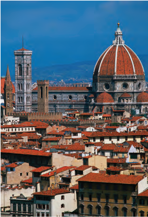
We visit splendid Florence on Day 12.

Day 16: Depart for U.S. We depart early this morning for our connecting flights to the U.S. B