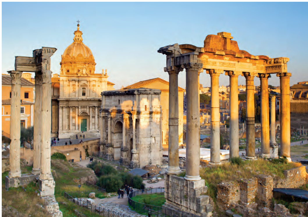
We tour Rome's Forum on Day 6.

Day 7: Rome Another morning of touring followed by a free afternoon. Today we visit the Vatican for a tour of St. Peter's Square and Basilica, and the Sistine Chapel in the Vatican Museums. Highlights include Michelangelo's Pieta in St. Peter's, considered one of the greatest sculptures of all time; his frescoed ceiling of the Sistine Chapel, now restored to its original glory; and art-filled St. Peter's itself, the most important church in all Christendom. B